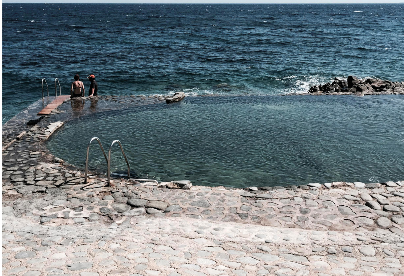
WORDS: CHARLOTTE BROOK